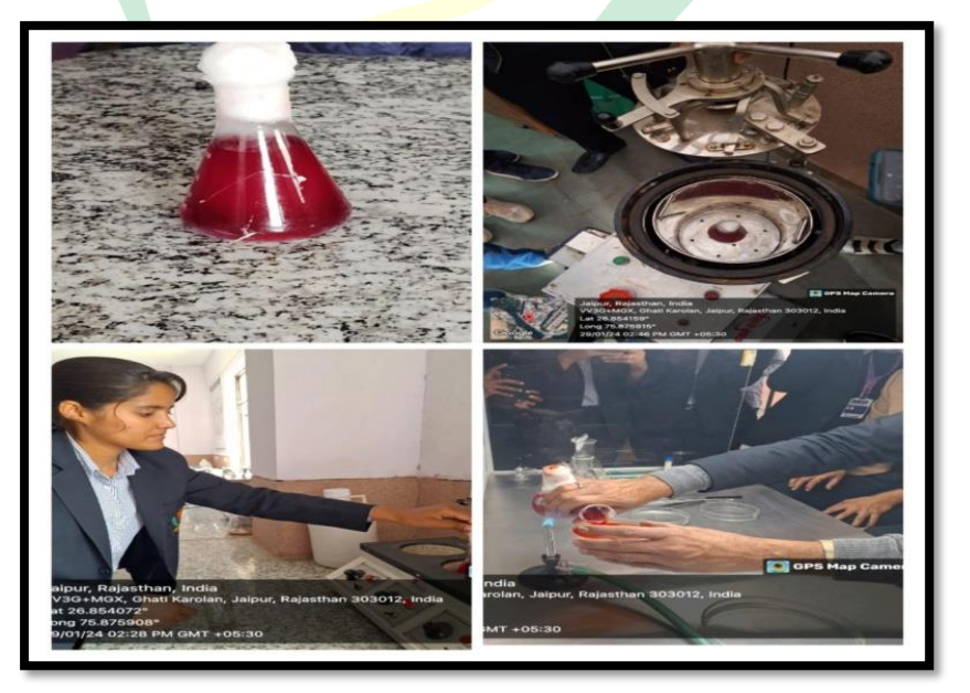
Fig 2: - Preparation of growth (CRYEMA) media