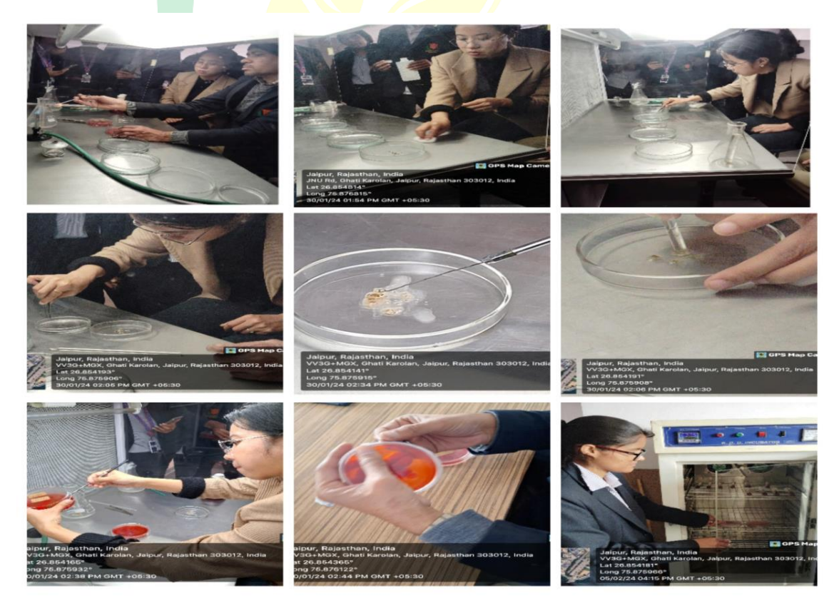
Fig 3: Step by step procedure of Rhizobium isolation and culturing